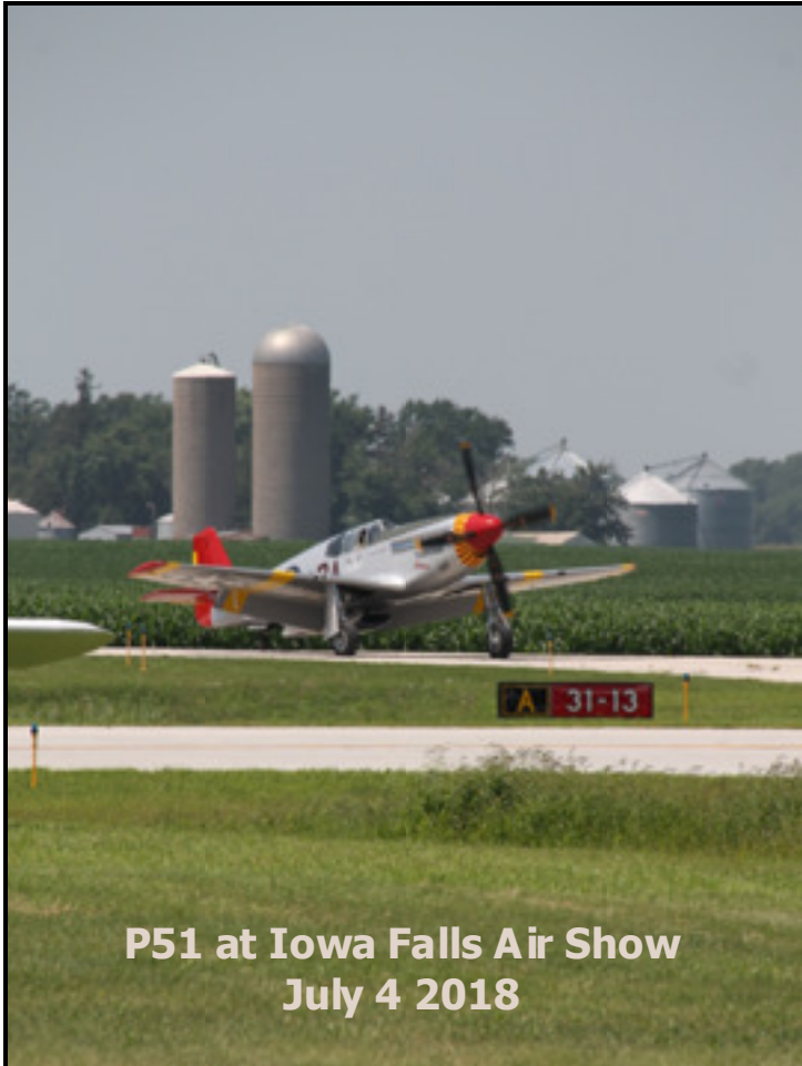
P51 at Iowa Falls Air Show July 4 2018

Sunday July 22nd Radcliffe EAA Chapter Come out and support the Roadrunners Flight Club Flight Breakfast 7:00 - 10:00