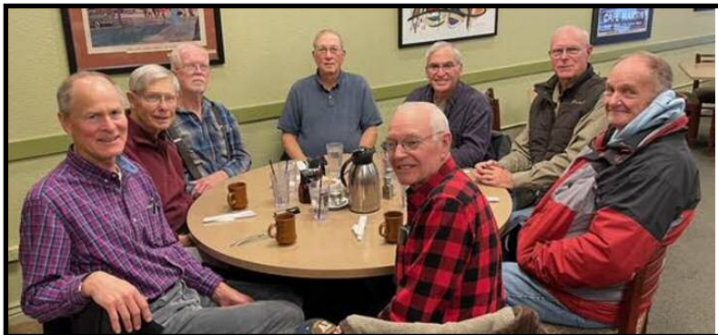
November 20 FOGZ in Marshalltown at the Tremont Restaurant

https://karlenepetitt.blogspot.com/2010/12/christmas-poem-aviation-style.html