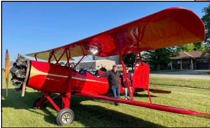
Marc Broer trained in an Exec 1 Skyhawk, here shown at Boone