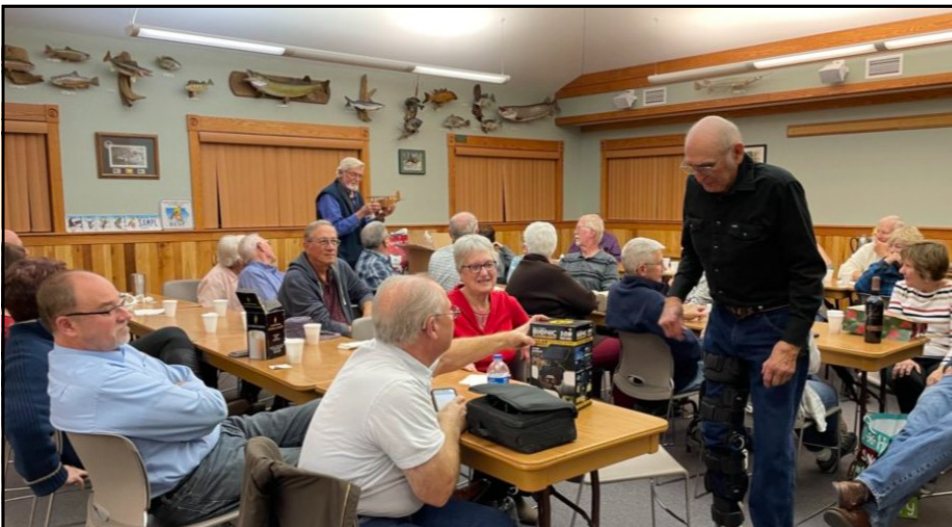
Marshalltown EAA Chapter 675 Christmas party with some EAA 135 members present