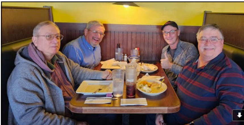
Lunch after treasury audit & board meeting