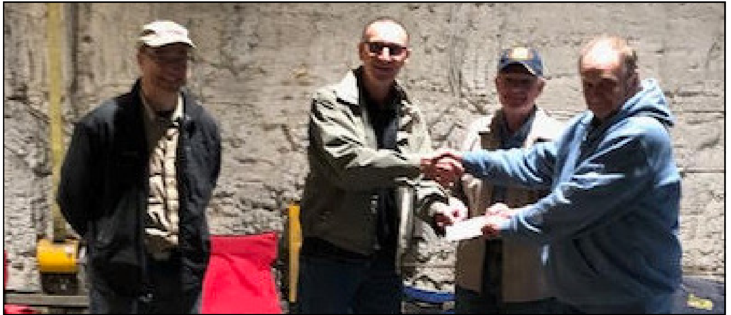
Our EAA Chapter 135 presented Marshalltown EAA Chapter 675 with a $500.00 check to add to their scholarship fund for students going into careers in aviation