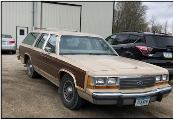
The Eldora Airport's Classic Courtesy Car made an appearance!