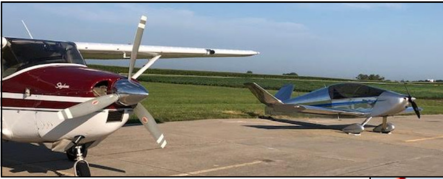
The FOGZ In Knoxville