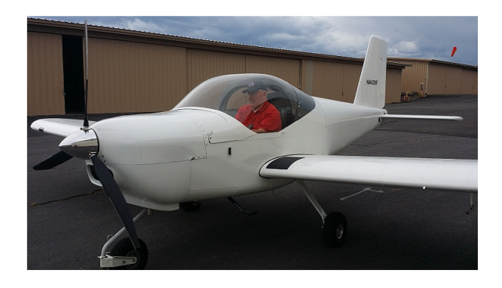
Congratulations Lloyd – another completion!