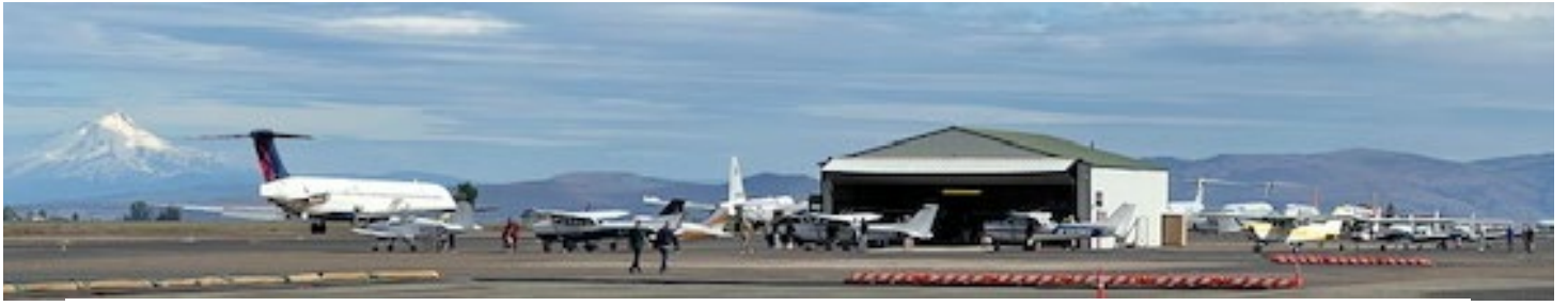
15 pilots and their planes lined up and ready to fly with Mt Hood in the background