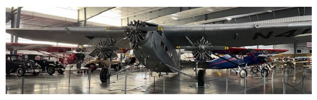
1929 Ford 5-AT-C TriMotor that we happened to see arrive during our visit last year.