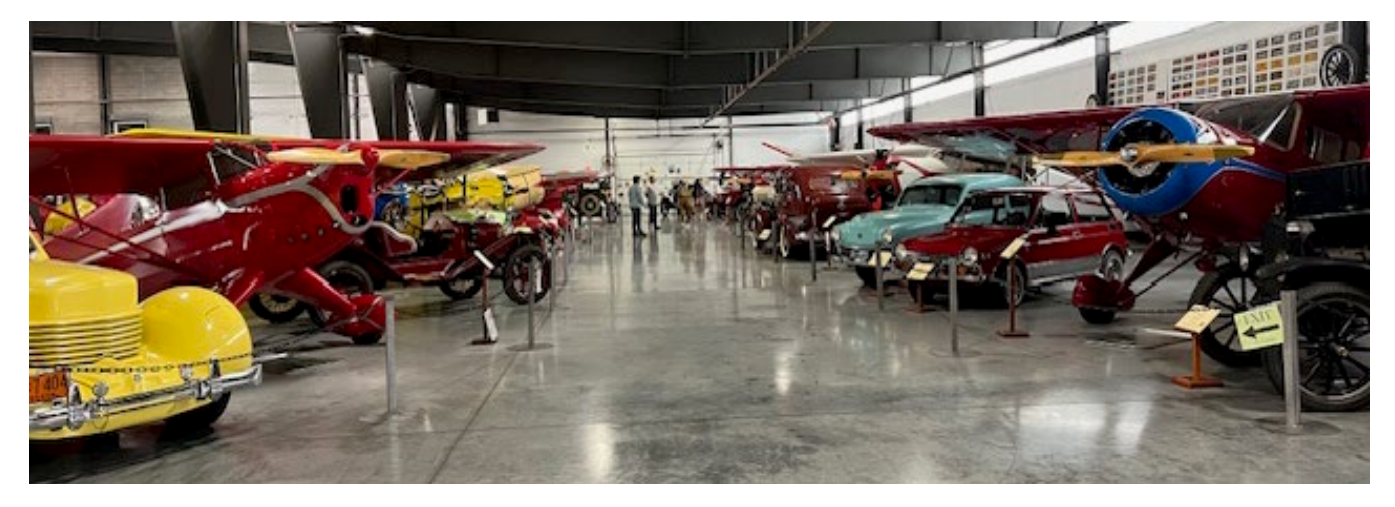
This is only one row of one of the two large hangars