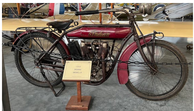
1917 Indian Model D Motorcycle