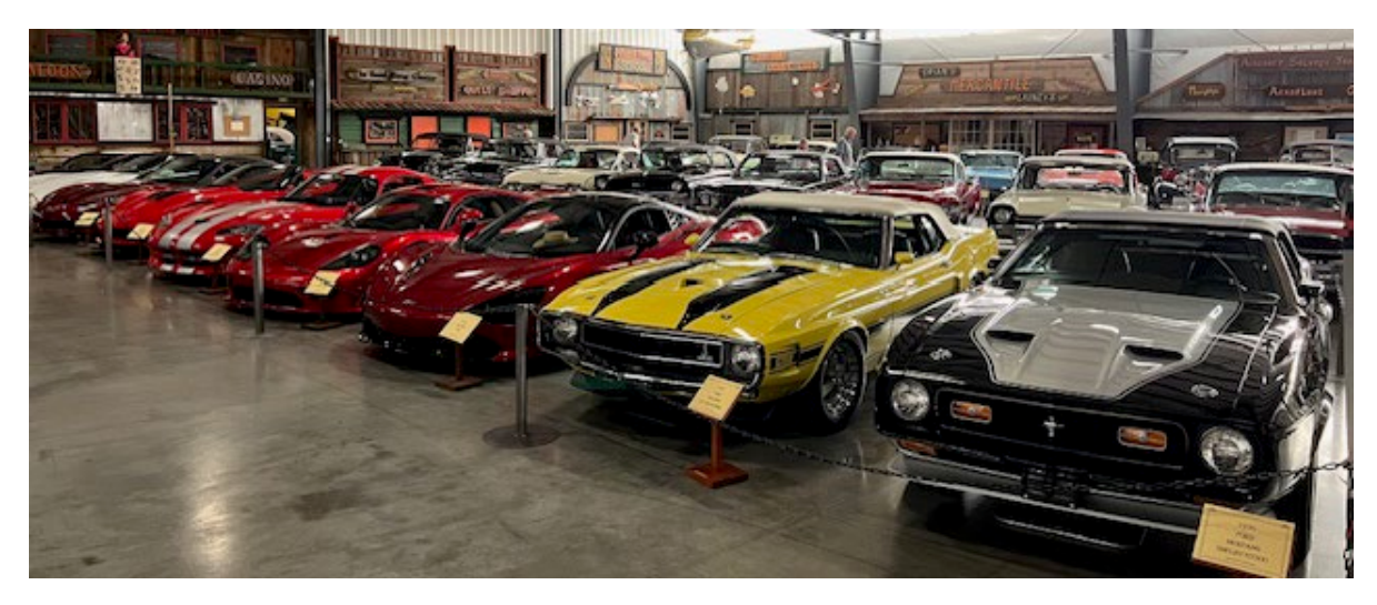
An amazing and expensive collection of sports and muscle cars