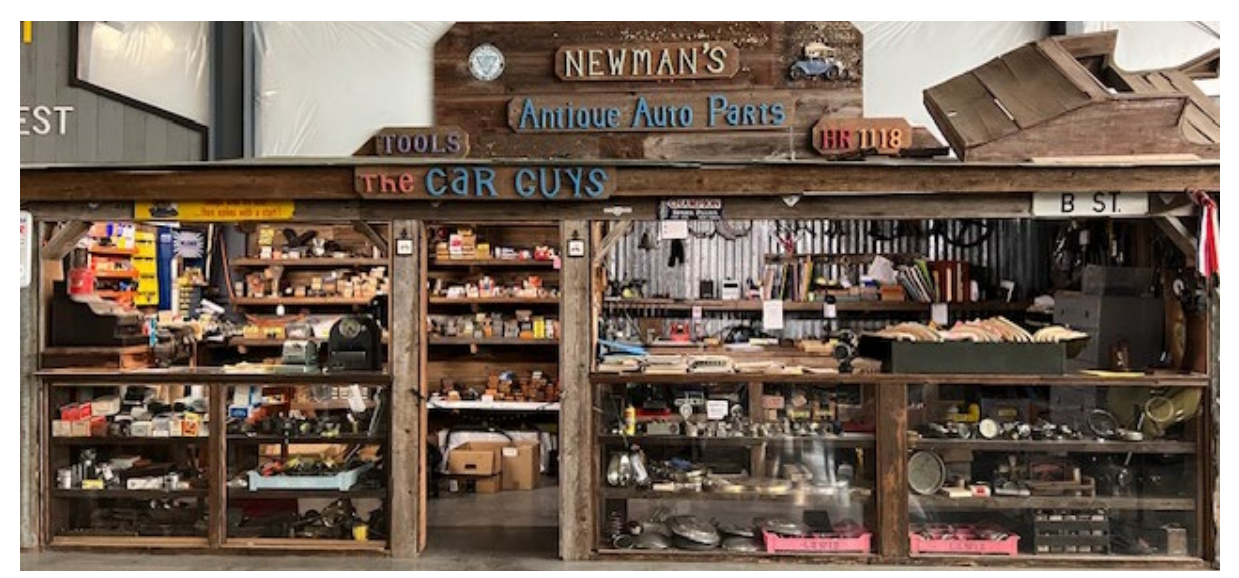
Display of antique car tools and parts in a workshop, which we learned is actually used to maintain the car collection