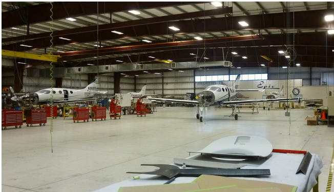
Four of the final seven Epic kitplanes – onward to certification!

We had a great turn out for the “Epic” tour. With all that they are trying to accomplish, they have their hands full so, it was an honor that we were given such a grand tour.