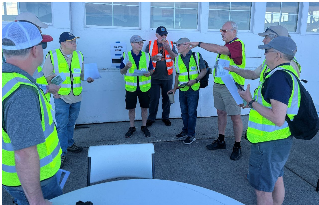
Pilot Morning Briefing