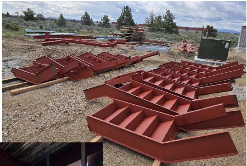
Stair sections for levels 1-3