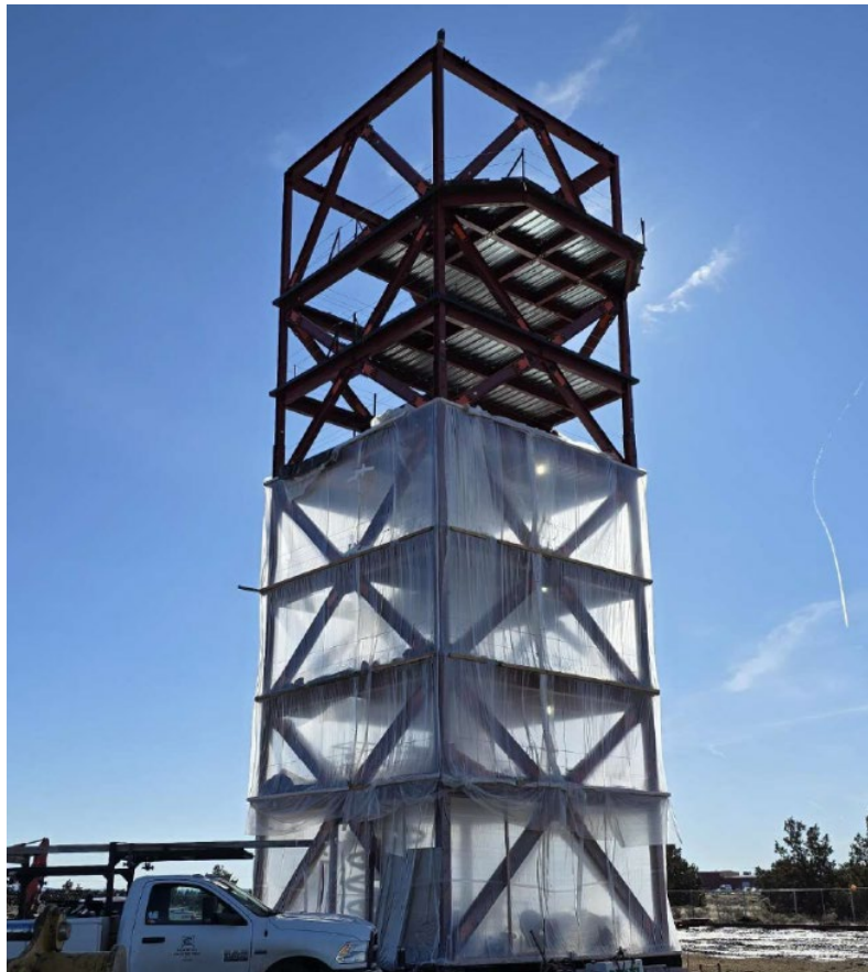
Photo Taken in March 2025 Back then, concrete floors were still being poured and had to be protected from cold weather via the plastic sheeting to help with curing.