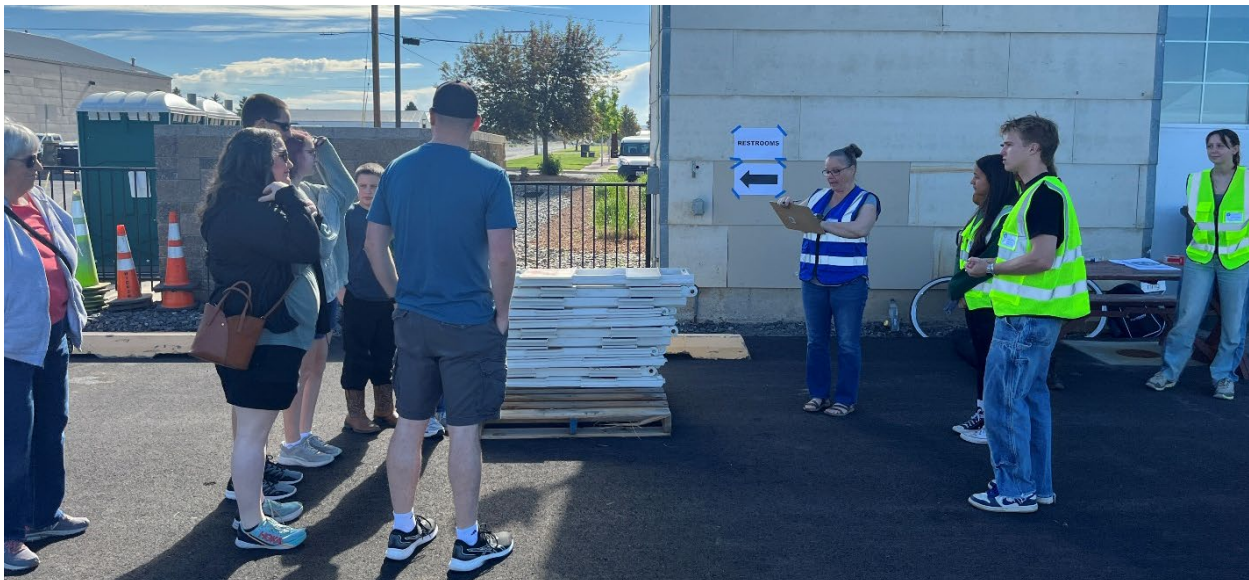
First Families Arrive