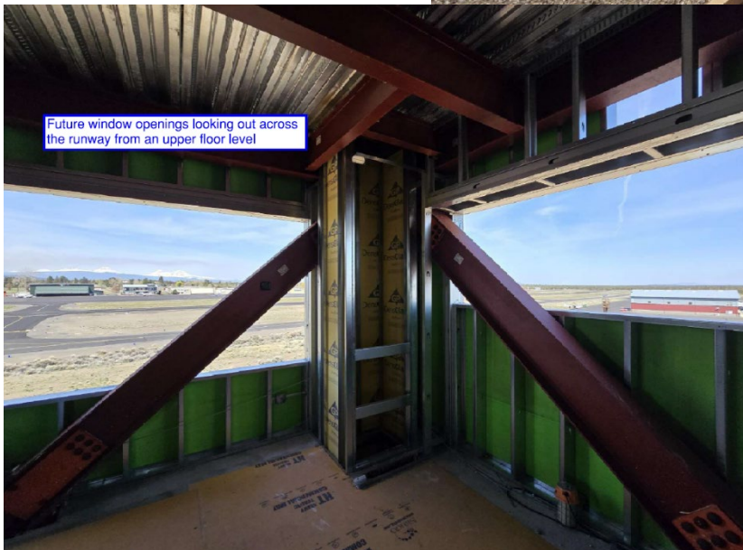
Future upper floor window openings with a view across the runway