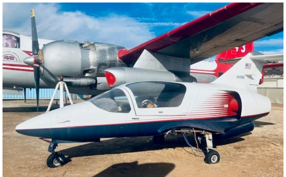
EAA Jet ~ just needs wings