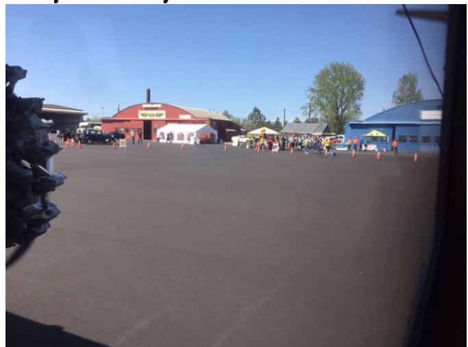
Trimotor at Bend

Our next Chapter meeting is on June 12<sup>th</sup> at the Bend Builders Assist Hangar, Bend Municipal Airport, 6 PM Pizza & burgers, 6:30PM Chapter Meeting