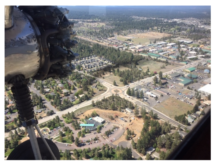
Trimotor over Bend