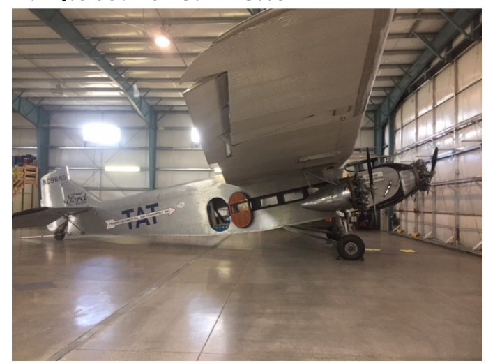
Safe for the night!