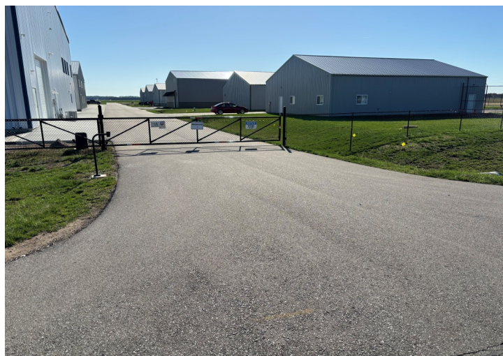
This is the view of Brett's hangar as seen from the gate at the west end of West Access Road 1.

As usual, the meeting will start at 9:30 and social time will precede the meeting. We will cover the business portion of the meeting in Brett's hangar and then move down the taxiway to Kevin Bowling's hangar to view his Sling TSi project. Kevin's hangar is the second hangar from the East end of West Access Road 1.