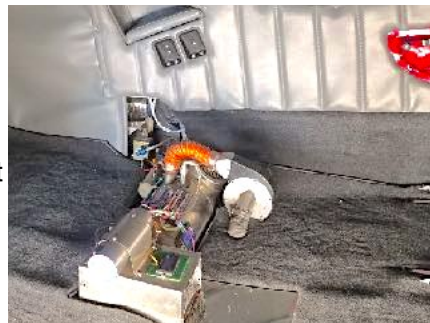
Trio ProPilot AutoPilot Installation

EAA CHAPTER 129 BLOOMINGTON-NORMAL, ILLINOIS