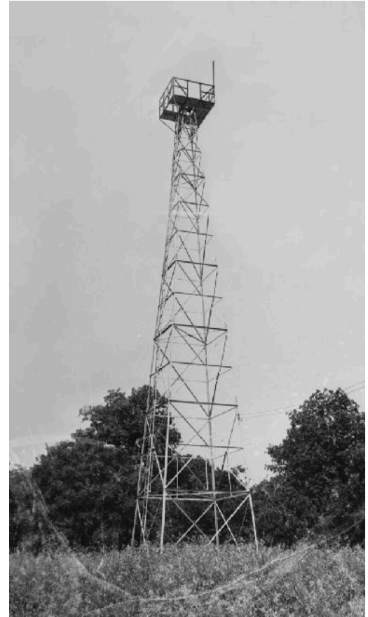
Lake Bloomington Beacon Tower 14 SLC Airway