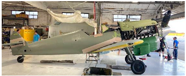
Current state of rebuild