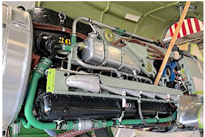
The Daimler-Benz DB605 inverted V12, 35.7L supercharged engine developing 1,455 HP