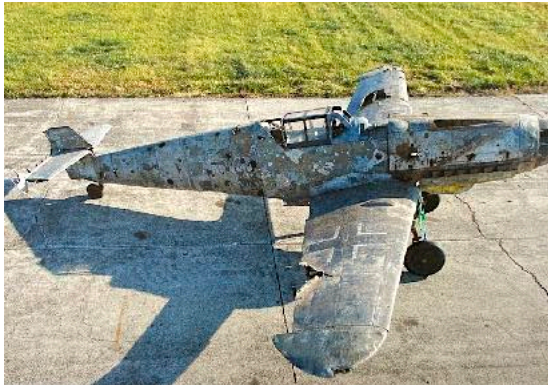
The original 109 after being pulled from the lake