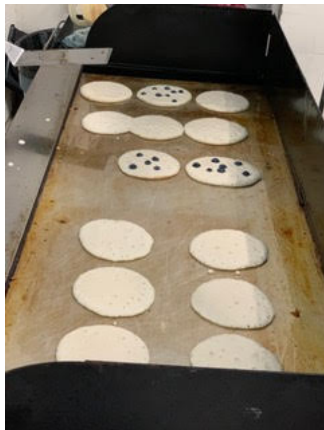
Blueberry Pancakes were offered thanks to a blueberry donation from Kathy Hirtz.