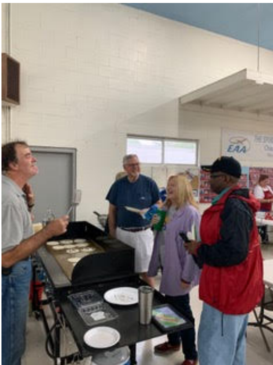
Folks in line got fresh pancakes right off the grill.