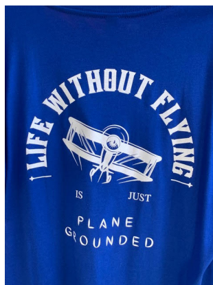
Quote choice 1 (located on back of shirt) "Life Without Flying is just Plane Grounded"