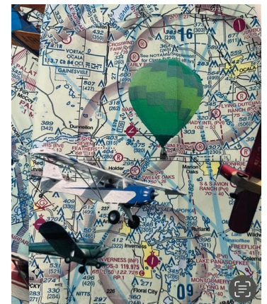
Detail right sleeve