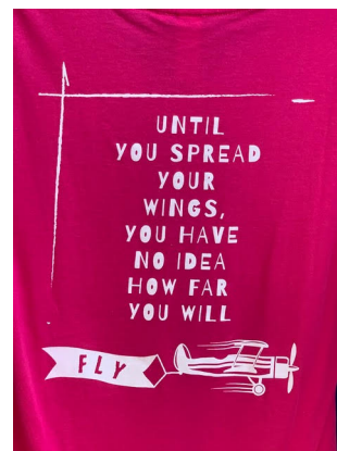
Quote choice 2 (located on back of shirt) "Until You Spread Your Wings, You Have No Idea How Far You Will Fly"