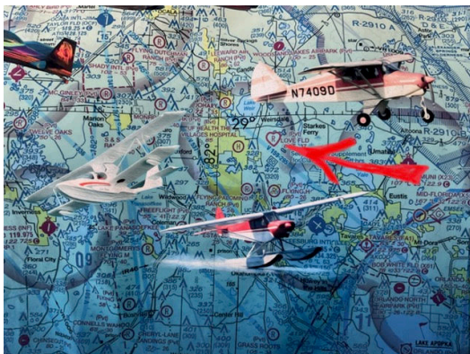
Arrow shows Loves Landing on chart