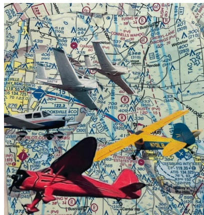
Detail left sleeve