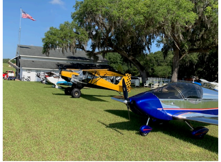
Members who flew in for the meeting...