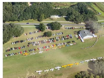
2022 Fly In with 2 car clubs in attendance.