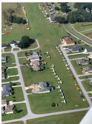
2022 Fly In

Signature Homes will be providing the much needed and appreciated porta potties.