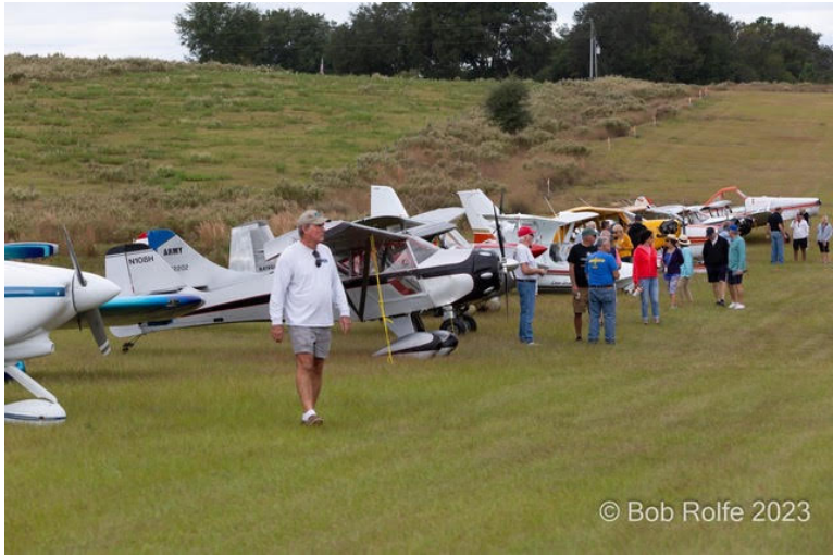
Visitors enjoyed walking the flight line to view the 120+ aircraft.