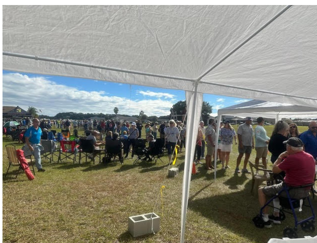
...and they lined up all at once for lunch!