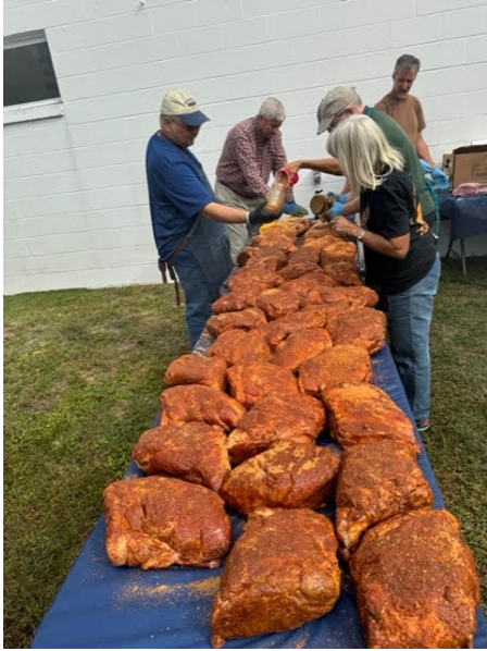
Friday's prep of the 40 pork butts - a lotta butt rubbing going on that day!