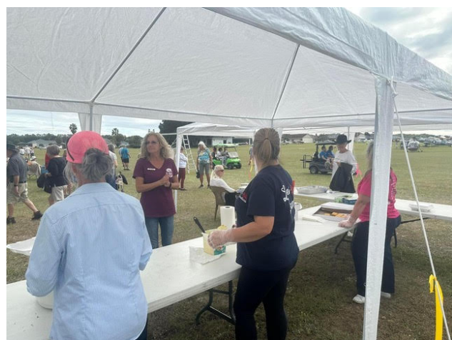
The food line readying for the onslaught of 400+ visitors with lunch tickets!