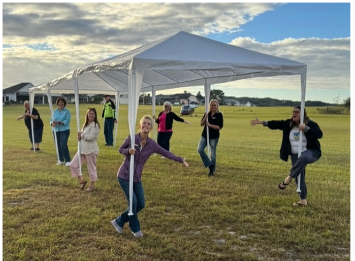
Setting up the pop ups! It takes a "village". . .