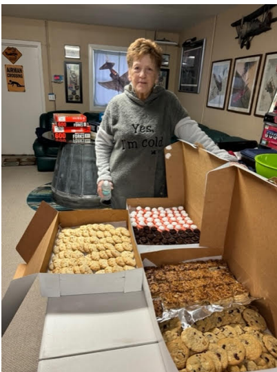
Dozens of volunteers made desserts. A friend of the Carlile's from The Villages, surprised us all by making over 260+ desserts for our fly in!