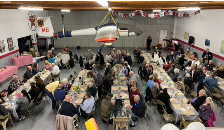
View from our January 2023 Membership Party. . .