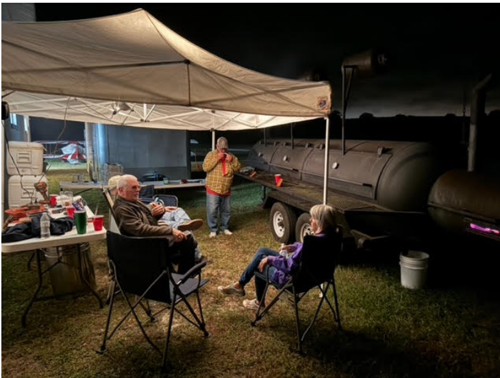
A number of folks kept the Tracy's company through the night while the pork butts were smoking away...