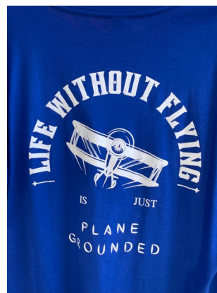
Quote choice 1 (located on back of shirt) "Life Without Flying is just Plane Grounded"