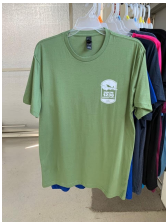
Men's style, crew neck Multiple colors & sizes available

Thanks to our Chapter Secretary, Ana Kircher, we now have new Chapter T-shirts. We have mens and ladies styles; sizes Sm to 3X. Multiple color choices and a choice of two aviation quotes on the back of the shirt. All shirts are priced at $25. Orders will be taken at the meeting. There are multiple size samples that can be tried on. We also have stocked up on the every popular "better than Yeti" Chapter mugs - great for ice cold or hot beverages. $20 each. Multiple colors available. $5 of each T-shirt or mug sale goes into the young aviator/mechanic donation fund.