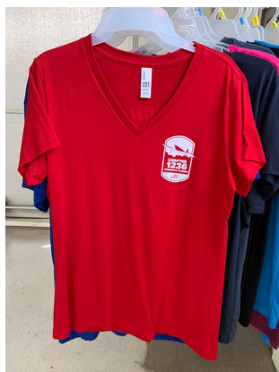
Ladies' style, V neck, Multiple colors & sizes available