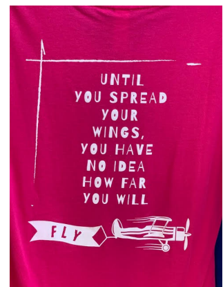
Quote choice 2 (located on back of shirt) "Until You Spread Your Wings, You Have No Idea How Far You Will Fly"