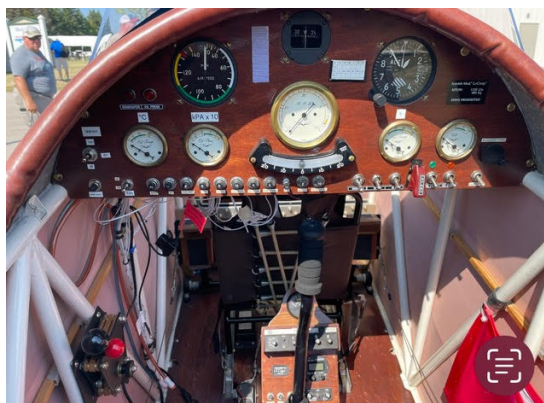
From Byron Covey: instrument panel in Rotec powered LoCamp, Oshkosh 2023

10,000+ total aircraft 677,00+ attended AirVenture 21,883 aircraft operations in 11 day period. 148 average of takeoffs and landings per hour. 3,365 total showplaces 1,497 registered in vintage aircraft parking. 1,067 homebuilt aircraft 380 warbirds 194 ultralights 134 seaplanes & amphibians 52 aerobatic aircraft 41 rotorcraft 13,000 camping sites inc aircraft/drive in 5,500 volunteers / 250,000+ hours 848 commercial exhibitors (a record #) 1,400 forums, workshops, presentations for week 2,372 registered international visitors.