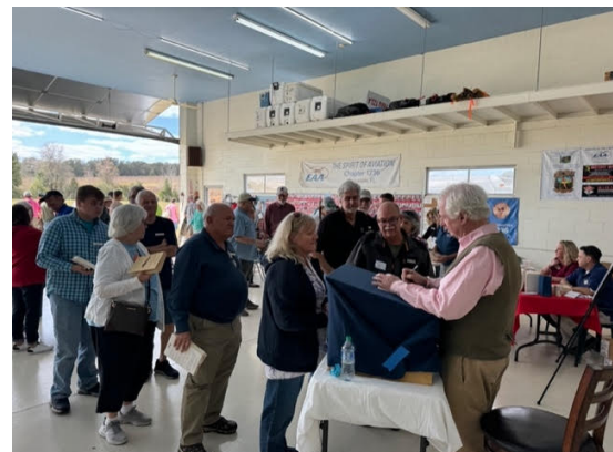
Long lines for book signing...