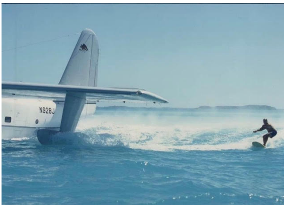
Buffett water skiing behind a seaplane.

One of the scariest flights he survived was when he had his family and U2 singer Bono onboard his seaplane on a flight to Jamaica. The authorities mistook his plane as a drug runner plane and started shooting at him. No one was hurt, but the plane took on many bullet holes. After that scare, Buffett wrote the song, Jamaica Mistaica.