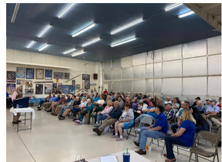
110 people attended this meeting.