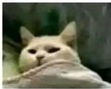
LOW FLYING AIRCRAFT

ALERT! ALERT! We REALLY need your help in finding speakers for future meetings. . .