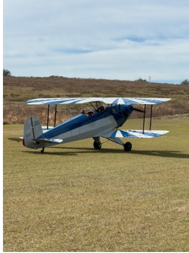
Rinker Buck in Dave's plane