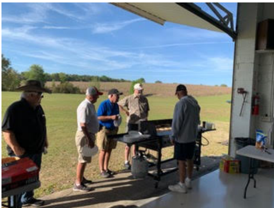
Watching Pancake Perfection in the making...March 2021