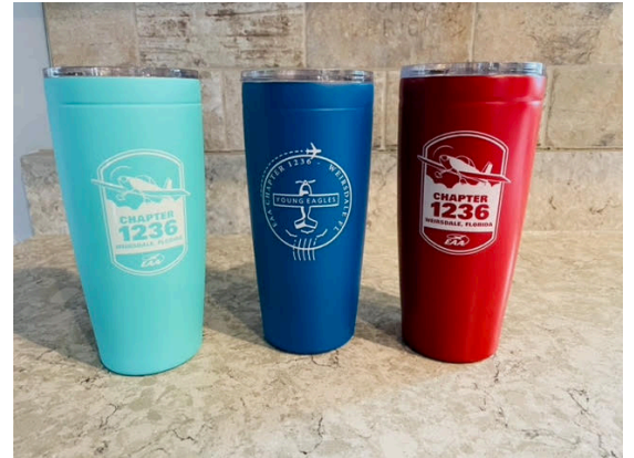
Our new mugs include the Young Eagles logo flip side of our chapter logo. $20 - A portion of the sales go to our donation fund for young men & women who would like to be pilots and/or mechanics.