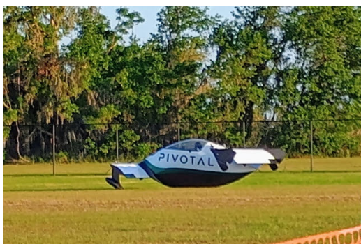
Tricia Angell shared snapshots of the electric Pivotal aircraft.

Tricia Angell with chapter and new friends made at Sun n Fun. Tricia and Mona Tripp volunteered at the ACE lounge - an area for sponsors to grab something to eat and drink - and watch the air shows. Great volunteer gig - the area was air conditioned!