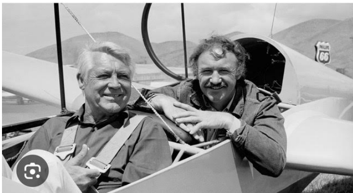
Hackman with Cary Grant in a glider.