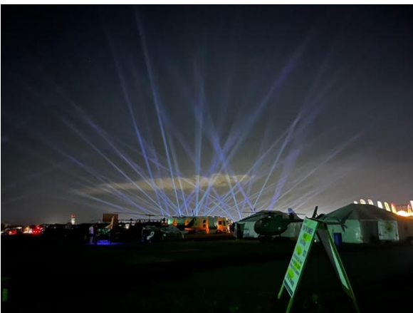
Found a YouTube video of the Grand Finale Night show. Only about 3 minutes long https://youtu.be/fTcEkGuajbo?si=B2vAYbPxqfQ0QJAV