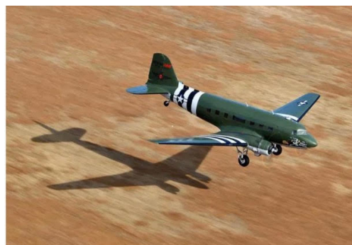
The aircraft shown above is Tim's C47A N33VW, Wabbit Expwess .

Maximum Speed: 224 mph (at 10,000 ft) Cruise Speed: 160 mph Range: 1,600 mi