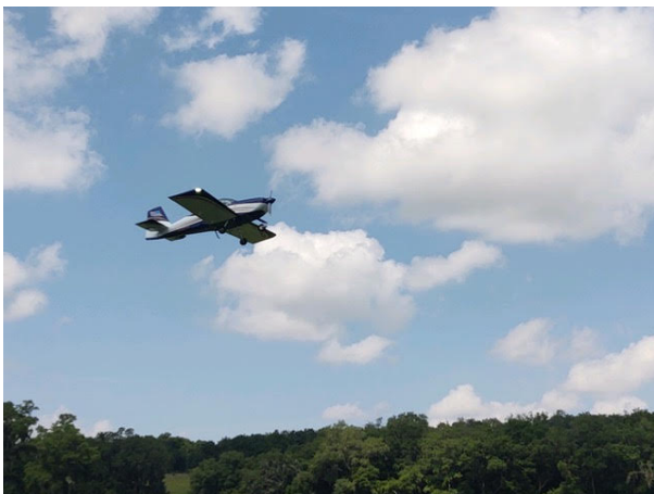
First Flight was a success!