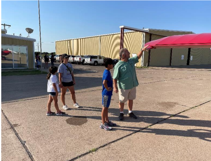
Explaining how the control surfaces work on an airplane to a Young Eagle.