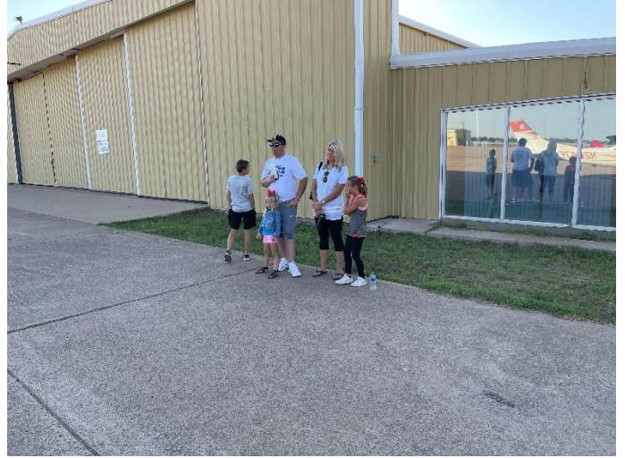
A family waiting for rides for the kids.