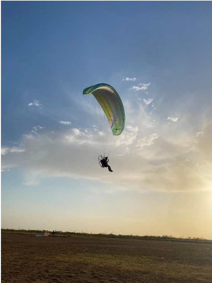
Giving us a nice fly by.