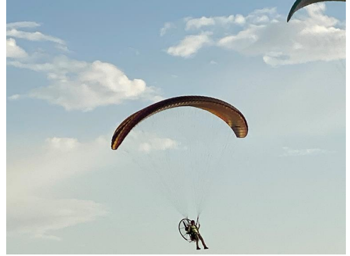
Careful with that landing gear!