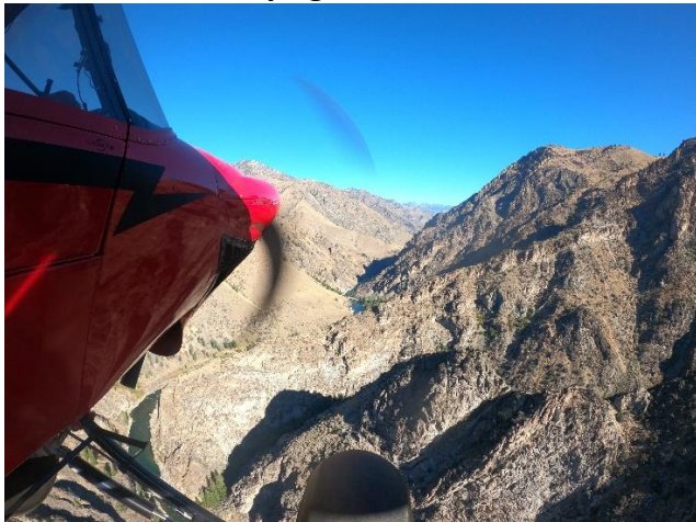
Some mountain flying.