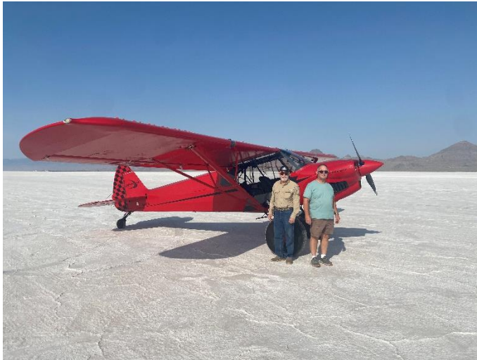
On the Bonneville Salt Flats.