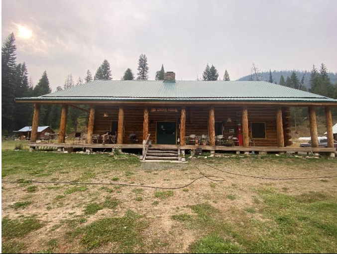
Big Creek Lodge (U60). Nice fly in lodge.