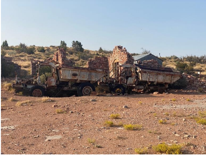
Abandoned copper mining equipment at Grand Gulch copper mine in AZ.