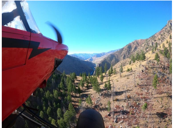
Flying in Idaho.