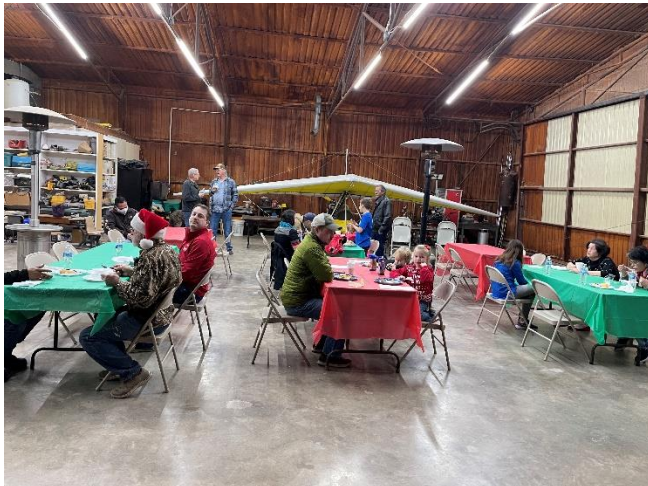
A few of the members at the Christmas Potluck.