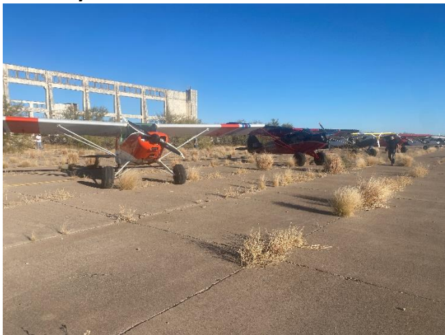
Does anyone know where this is?