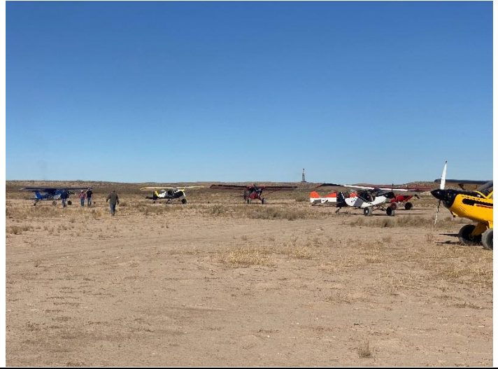
Somewhere “West of the Pecos”!