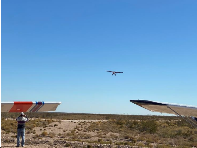
Some of our members doing some backcountry flying.