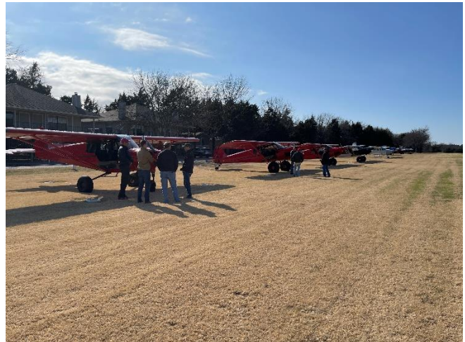
Some members at 3T0 (Cedar Mills) for lunch at Pelican’s Landing.