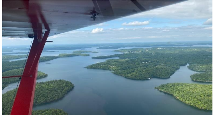
Beautiful day to fly

We took some time off flying to fish. Heath got the big one.