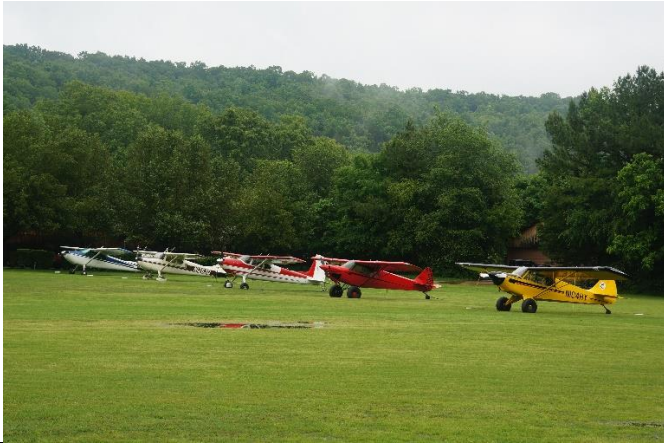
Lined up at Gaston's Resort Airstrip