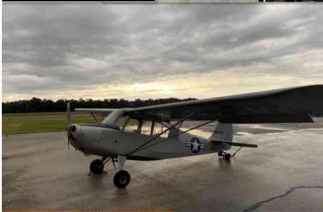
L-16A AND L-16B