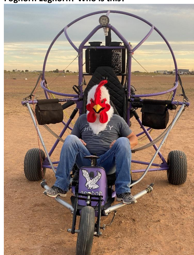
Foghorn Leghorn? Who is this?