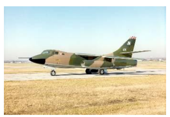
Douglas RB-66 Destroyer