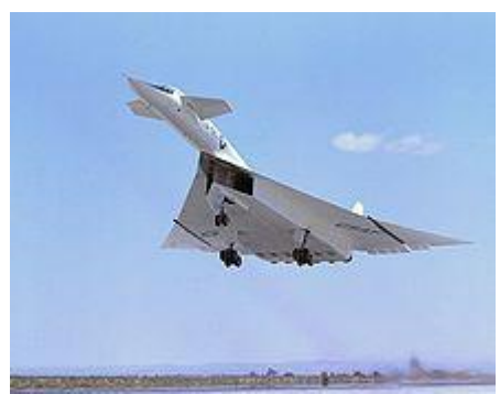
North American XB-70 Valkyrie