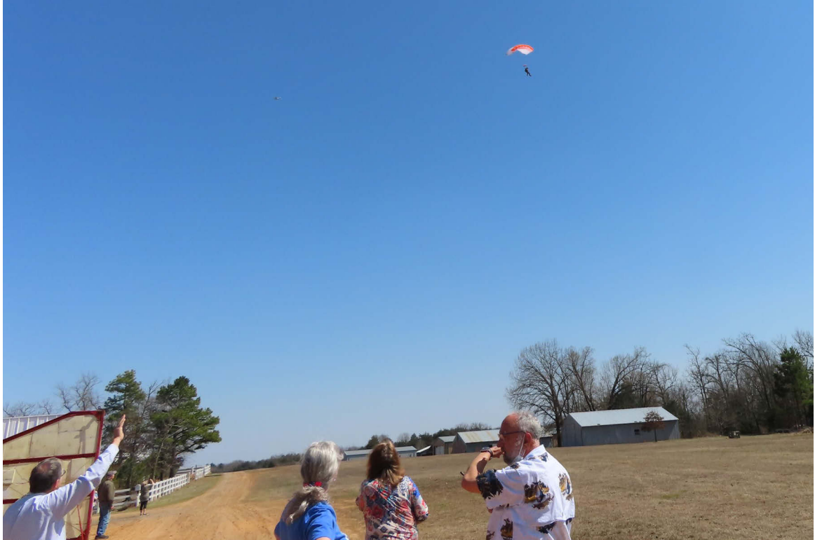
Here they come!