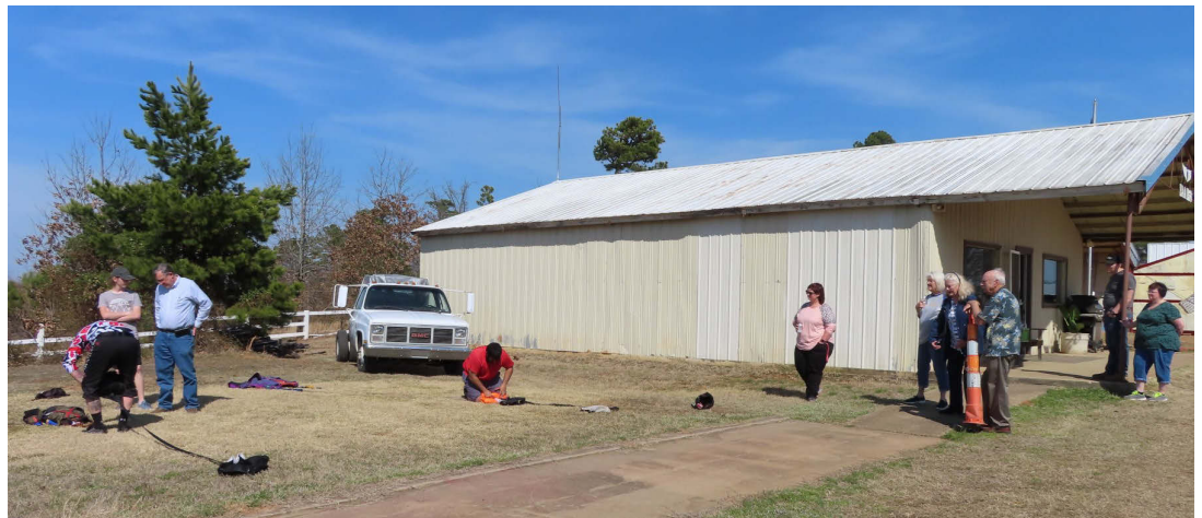
Parachute Packing Demonstration

If you have the urge to jump out of an airplane, go see these guys.