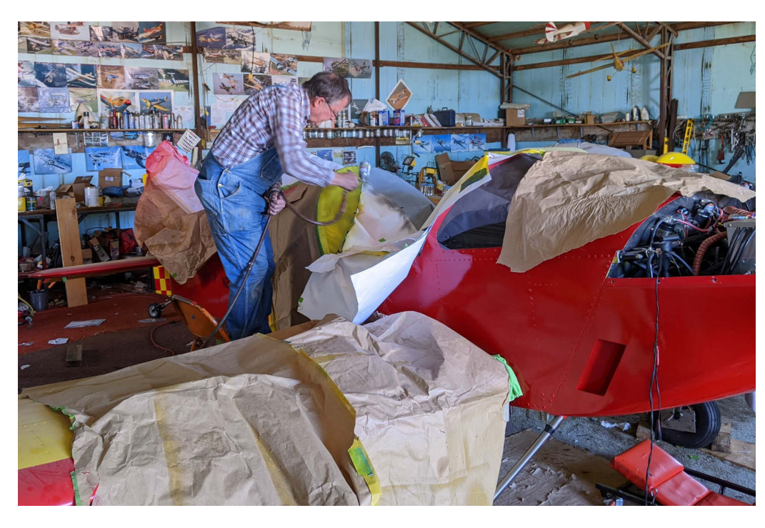
David painting the seat bulkhead yellow in preparation to receive the requisite "Experimental" placard.

We should be seeing a red and yellow streak flying down the runway very soon.