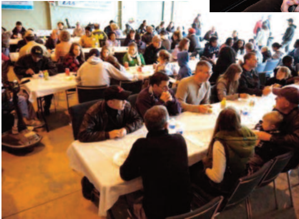
Chili Fly-in.