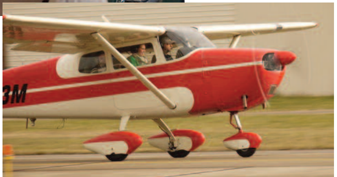
Young Eagles Flight with Shachar Golan.