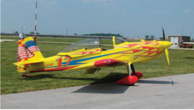
Metcalfe Airport