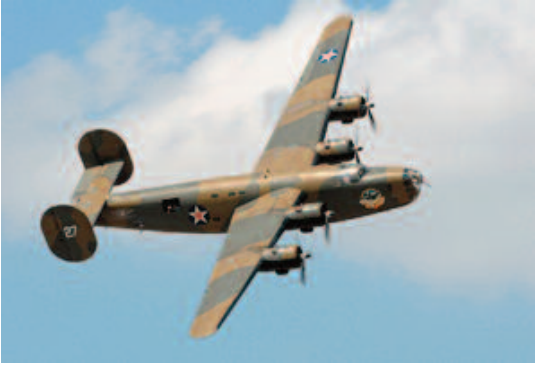
CAF's B-24, Diamond Lil.