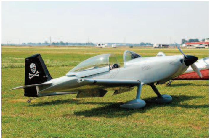
Chapter 582 Memorial Day Fly-in at Metcalf KTDZ