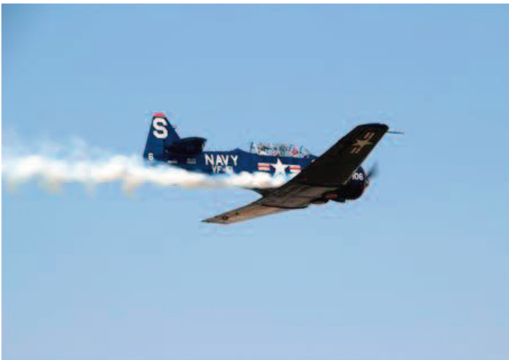
Chapter 582 Memorial Day Fly-in at Metcalfe KTDZ