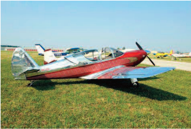
Chapter 582 Memorial Day Fly-in at Metcalf KTDZ