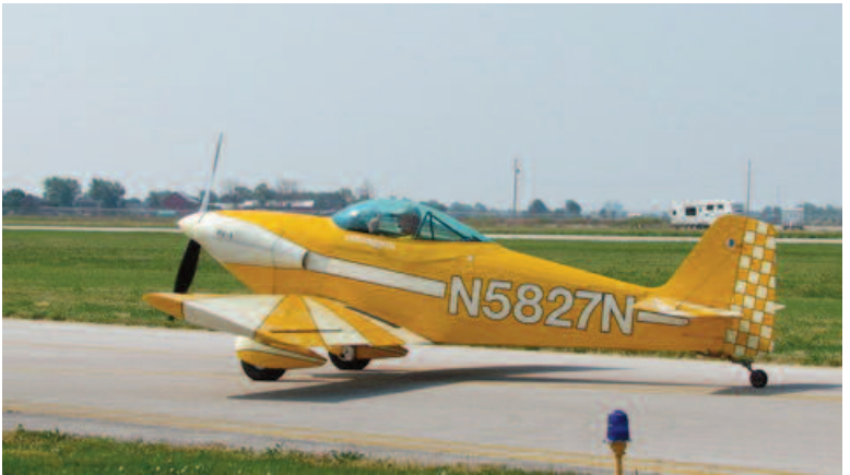
Metcalfe Airport