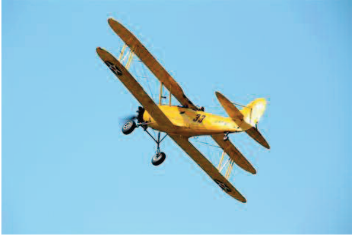
Chapter 582 Memorial Day Fly-in at Metcalf KTDZ