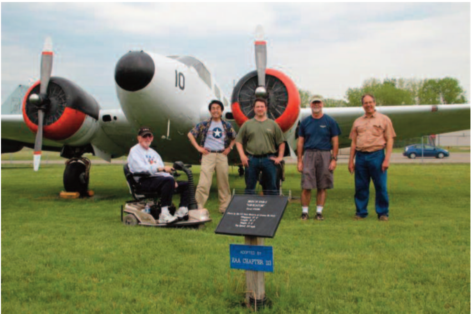
Selfridge Airplane Wash Crew