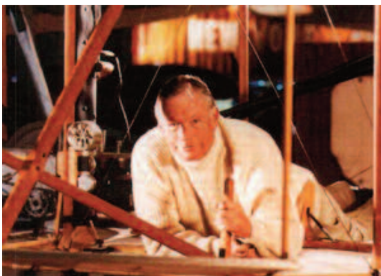
Neil Armstrong pictured in 1993 on EAA's Wright Flyer replica in the AirVenture Museum.

Armstrong's family concluded their statement with a simple yet poignant request for people wishing to honor their loving husband, father, grandfather, brother, and friend: "Honor his example of service, accomplishment, and modesty, and the next time you walk outside on a clear night and see the moon smiling down at you, think of Neil Armstrong and give him a wink."