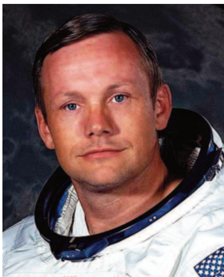
Neil Armstrong - 1930-2012

Neil's simple and eloquent reply: "You know, we pilots don't care an awful lot about walking. We like to fly."