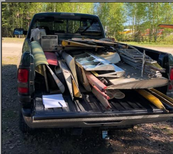
A truck load of “good parts” for sale from Jimmy Anderson’s storage.