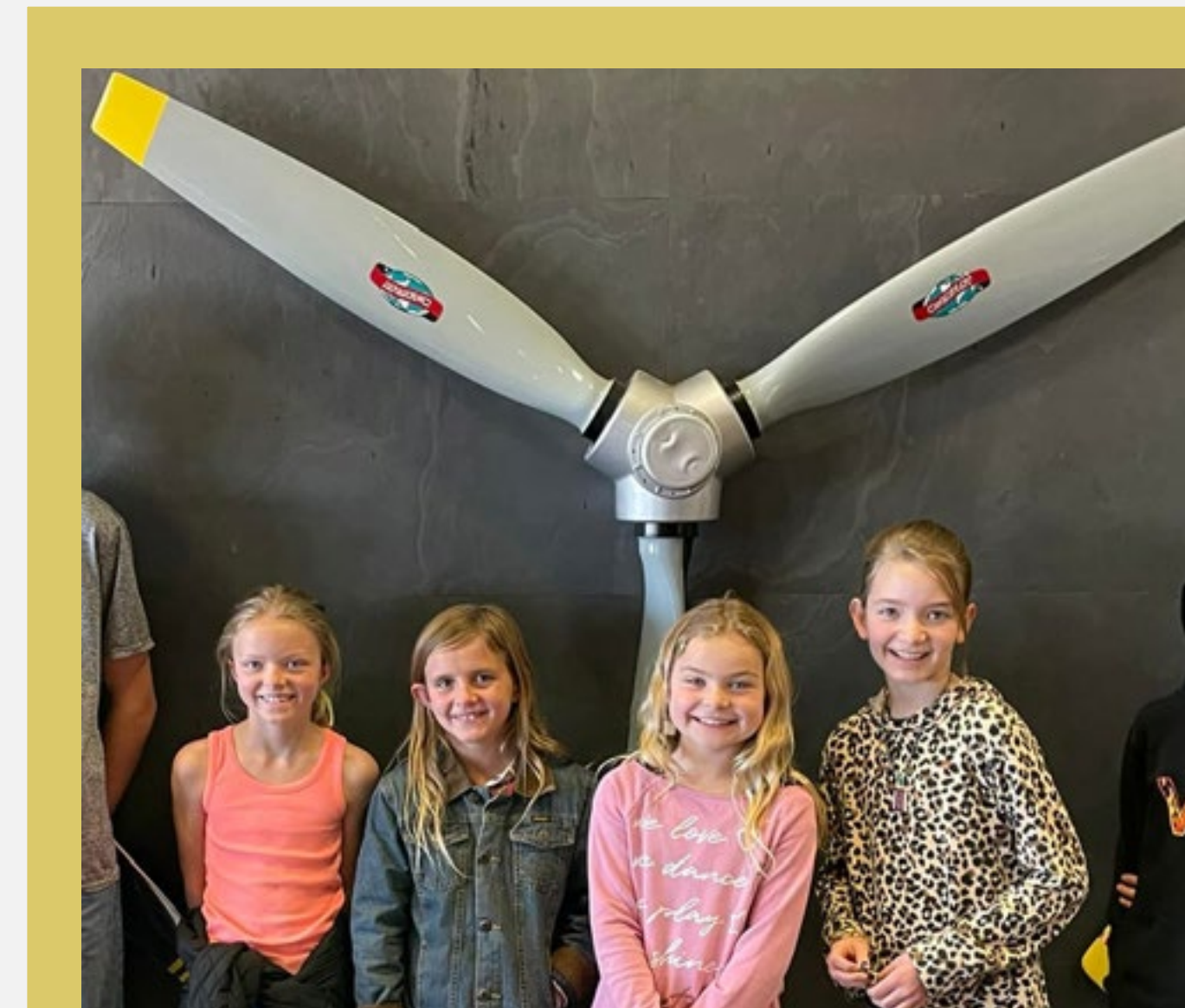
Well attended Young Eagles Day!

EX AT PILOTS BUILDERS EAA EXPERIMENTAL AVI