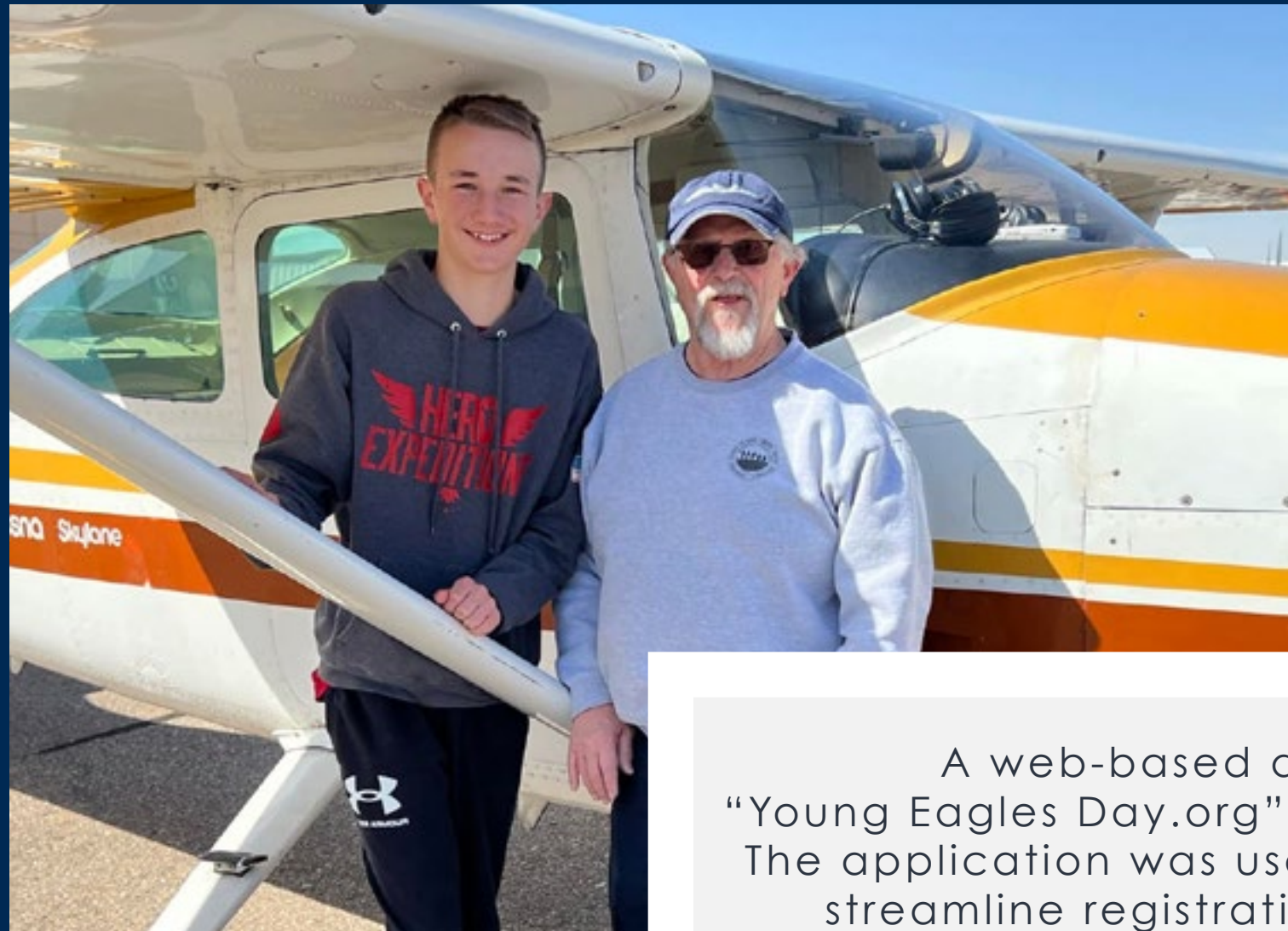
Young Eagles are all-smiles

A web-based application called "Young Eagles Day.org" was used for the first time. The application was used to schedule the flights, streamline registration, and help track the pairing of the Young Eagles with pilots.