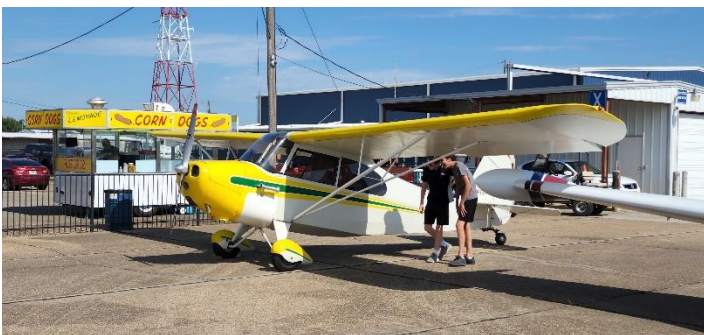
It matches the Corn Dog stand!