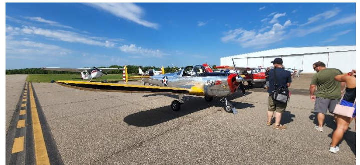
Ye Olde Ercoupe