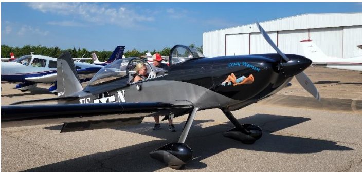
RV "Crazy Woman"