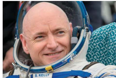
CAPTAIN SCOTT KELLY

Captain Scott Kelly's epic Endurance: My Year in Space and Our Journey to Mars , now a New York Times best-selling book, solidified his status as one of the greatest pioneers in history. In his acclaimed speech appearances, he now brings audiences to the edge of their seats with transcendent insights that inspire and challenge them to dream big, test the status quo, and "choose to do the hard things."