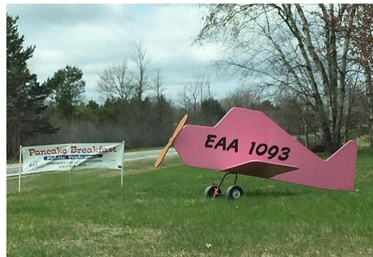
May 4 th Pancake Breakfast - Pink Airplane

Our next meeting will be June 1 st , 2019 at 10AM