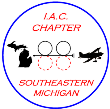
Contest Dates are July 13 and 14, 2019

The International Aerobatic Club (IAC) is a division of the Experimental Aircraft Association (EAA). The core purpose of the IAC is to promote and enhance safety and the enjoyment of sport aerobatics through openness and inclusiveness, a passion and responsibility to educate and share our knowledge both inside and outside the IAC, a commitment and responsibility to safety and excellence in every aspect of our sport and fair play and sportsmanship. To find out more about IAC and our programs and services, please visit our home page at <u>www.IAC.org</u>.