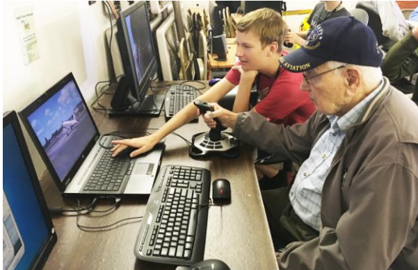
A 16 year old student pilot helping a 98 year old WWII Aircraft carrier pilot fly on a simulator