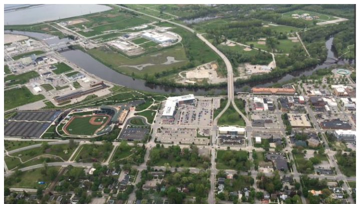
Recent photo of Midland from the air

As a part of their team, you would fly King Air 90s and 200s collecting data for a variety of missions including aerial photography, aerial mapping, geophysical survey, disaster recovery and air sampling. The flying is precise, intense, and hands-on. You will not only build multi-engine hours, but also build your capabilities and experience as a pilot. It won’t be just flying point A to point B. Your unique missions could include: scanning a coastline for scientific research for NASA, test flying a satellite sensor, surveying the snow pack in the Sierra Nevada, or counting seals in the Bering Strait. Dynamic Aviation’s Airborne Data Acquisition business segment is growing and hiring. If you’re looking for a company with great people where you can grow your skills, travel and make a difference, this is the place for you. Apply today! For more information click here .