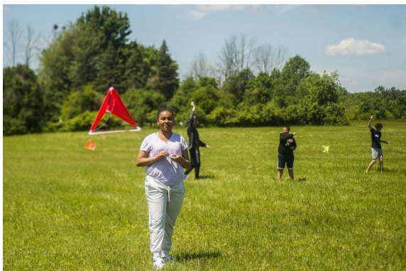
Flying a tetrahedron kite they built

As the campers gained first-hand knowledge and hands-on experience in these areas. Participants also learned about careers in aviation, met local pilots and viewed airplanes based at Midland Barstow Airport.