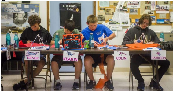
Building tetrahedron kites