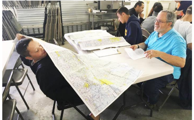
Planning a trip before the invention of the iPad!

The campers were then invited to participate in a Young Eagles Flight Day on Saturday, June 29 with EAA members who are experienced pilots. The Flights followed a route that the campers planned from the lessons learned during the week that took them from Jack Barstow Airport to Mount Pleasant, then Gladwin and back to Midland. Every participant was given a logbook signed by their mentor pilot with a record of their flight. This logbook allows you to search for yourself or for the pilot who signed your logbook and took you up flying.