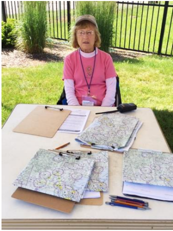
Finally, flight plan completed - ready to go flying