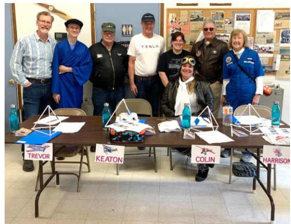
Several 'crew' leaders running the camp