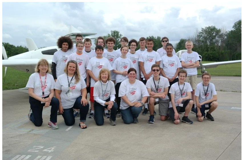
2019 Midland Barstow Aviation Camp (see p. 2-5)

Our next meeting will be August 3 rd , 2019 at 10AM