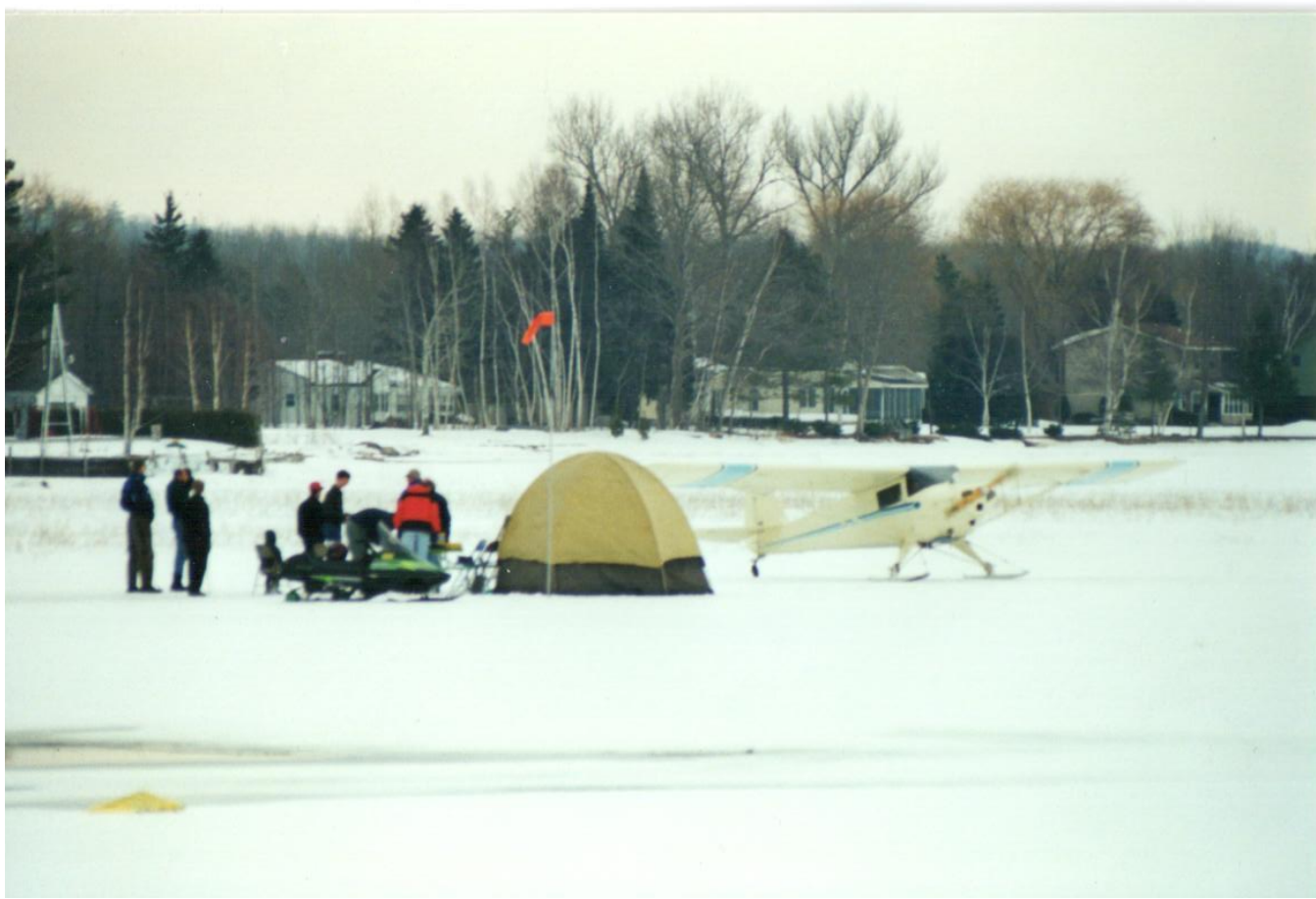
The chill thrill – on crooked lake