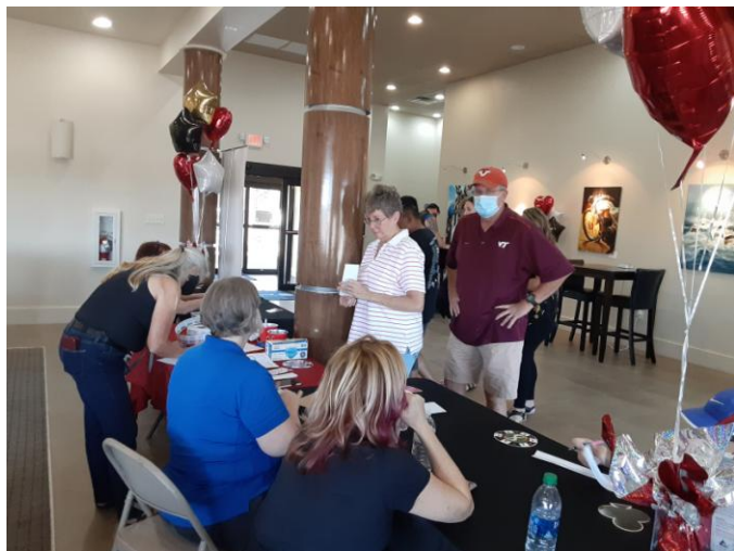
Who is that masked man?