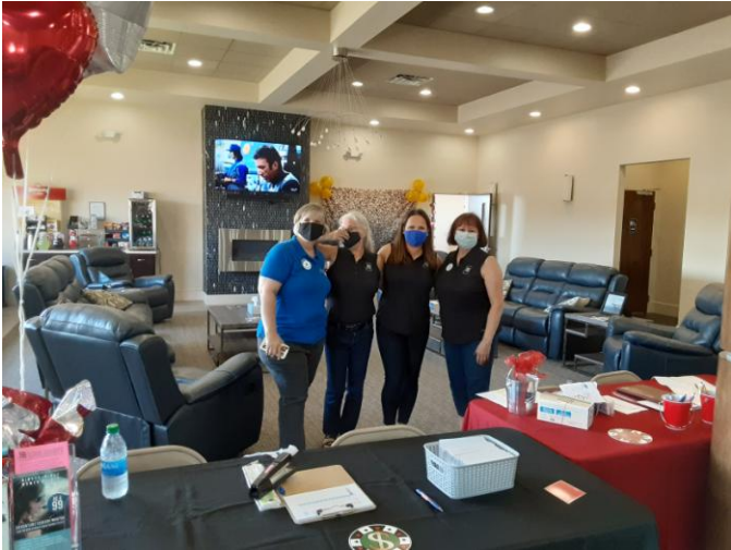
Mask on - Mask off!