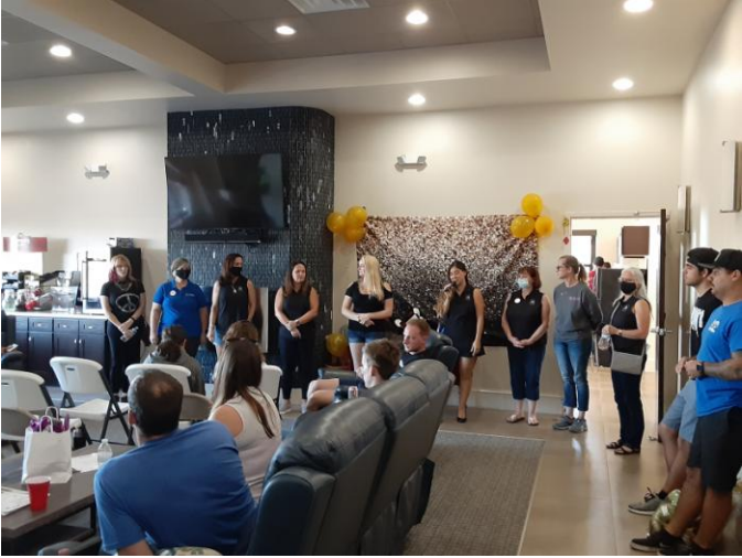
The crew responsible for the event