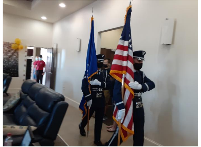
Honor Guard from Eglin