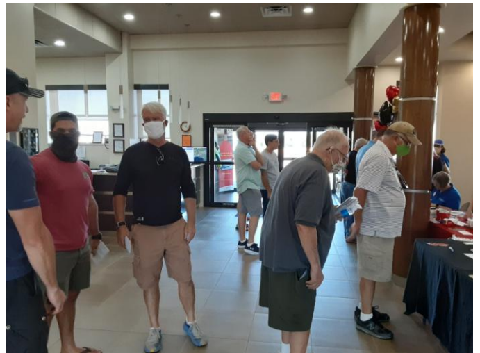
Another Charlie! (sorry Chad, I didn't take your picture)