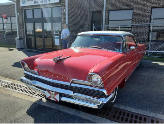
A real Classic from the fiftys!