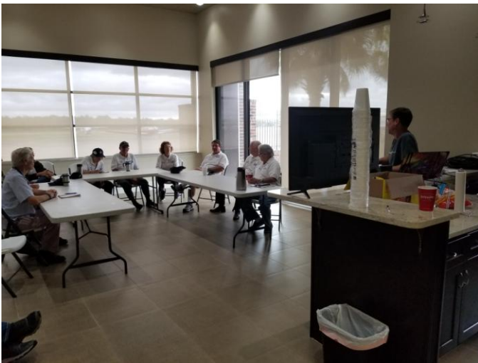
Seen at KCEW