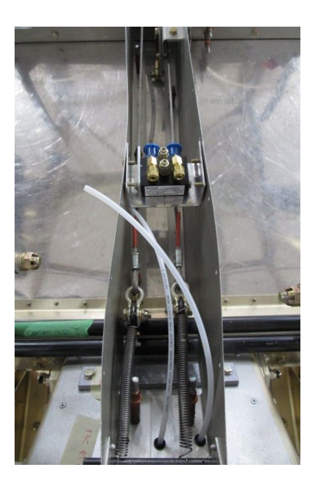
Looking aft from the nose gearbox to parking brake valve.

1. Todd is still building his Bede BD-4C four seater aircraft, as his wife reminds him weekly .... Good news – the parking brake valve finally arrived! Lines were run and holes drilled to accommodate the brake lines. I built a bracket to hold the valve just under the forward control tunnel. That would allow the valve shutoff arm to protrude through the top and be easily attached to a brake valve rod and handle. I built the bracket out of 0.025" aluminum and quickly realized that won't work when the flanges bent when I accidentally pressed on one side. Back to the sheet metal brake and some 0.063" aluminum that solved that problem. I attached the brake lines to the tunnel with clamps ensuring that they didn't interfere with the rudder cable runs. I connected the 90 deg fittings to the top inlets and connected the lines and then realized ... that I had neglected to order the couplers for the outlets! Should be here by the end of